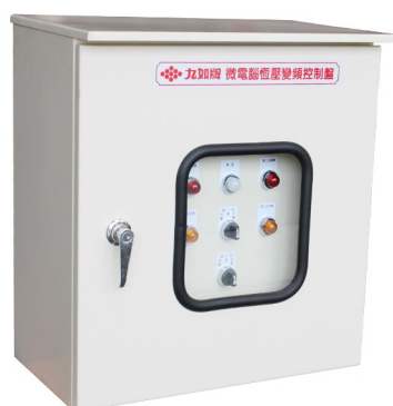
Inverter pump control panel (double-layer door)