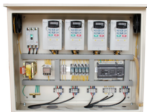
Multiple inverter systems inside layout

▲ It is adequate for all kinds of EVERGUSH water pumps