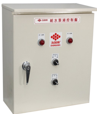
water supply/booter pump control panel