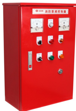
Fire pump control panel