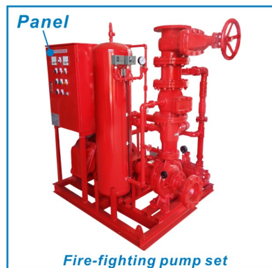
Fire-fighting pump set