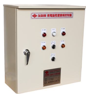
Inverter pump control panel (standard type)