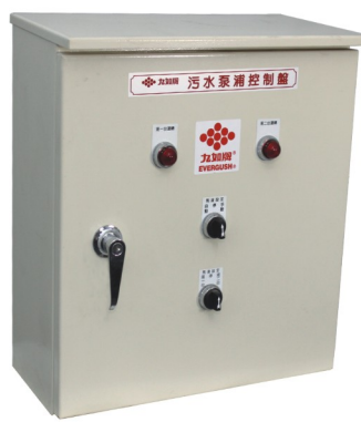
Submersible pump control panel