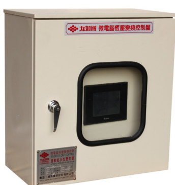
Inverter pump control panel (double-layer door with touch screen)